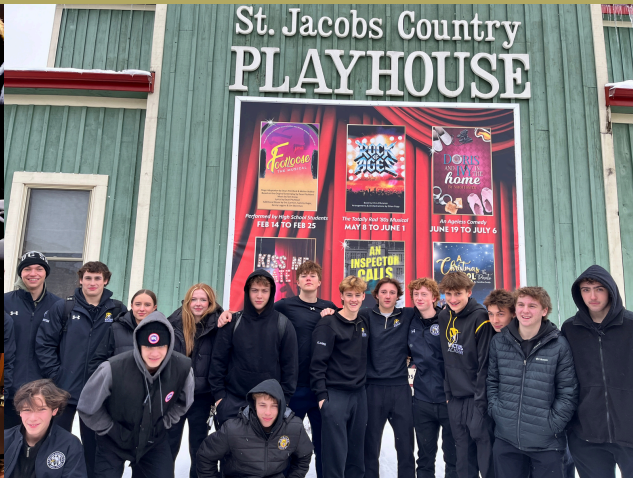
Grade 11 & 12 students were able to see "A Christmas Carol" at the St. Jacobs Country Playhouse!